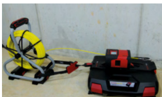
RM35 with belt and clip system connected to GF4.5 fiberglass rod