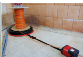
RM35 with belt and clip system connected to XB 500